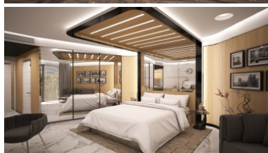
Unit type A: universal