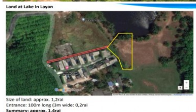
Land at Lake in Layan Size of land: approx. 1,2rai Entrance: 100m long (3m wide: 0,2rai) Summary: approx. 1,4rai