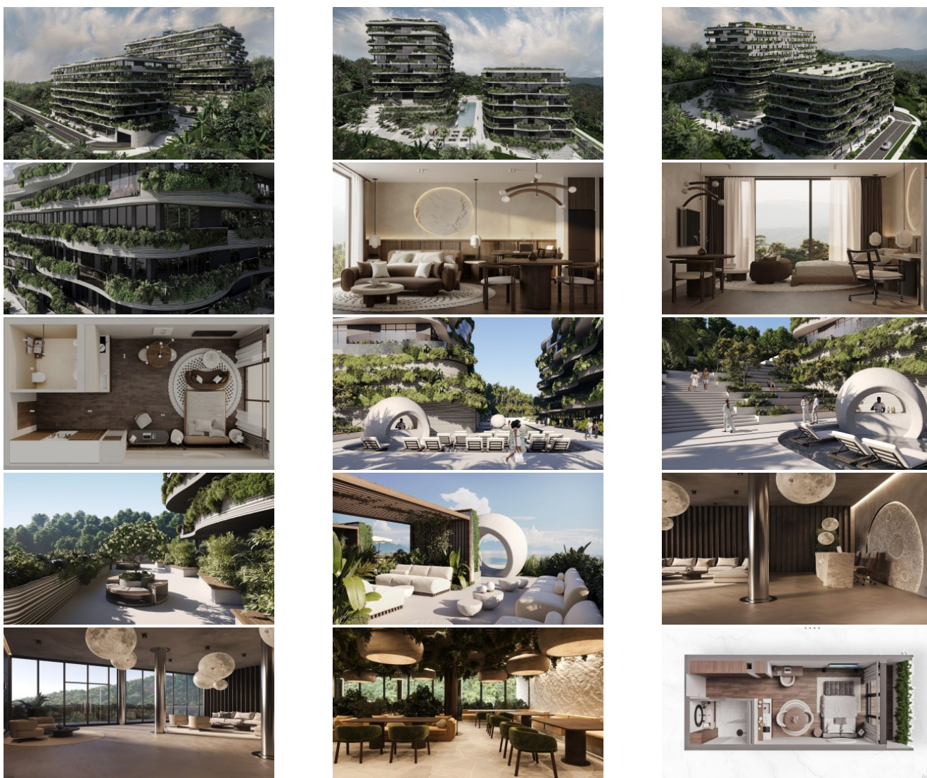
Building 1, 2nd floor