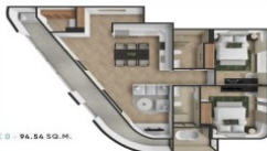
TYPICAL ROOM TYPE D - 94.54 SQ.M.