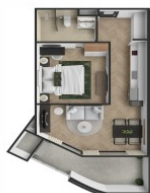
TYPICAL ROOM TYPE G - 51.04 SQ.M.