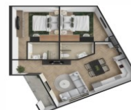
TYPICAL ROOM TYPE I - 89.91 SQ.M.