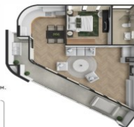
TYPICAL ROOM TYPE E - 70.54 SQ.M.