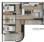
TYPICAL ROOM TYPE H - 71.97 SQ.M.