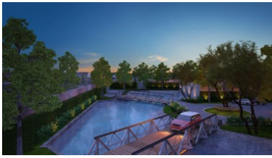
3 BEDROOM VILLA UPPER FLOOR PLAN