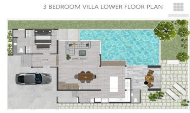
3 BEDROOM VILLA LOWER FLOOR PLAN