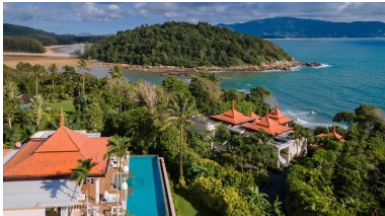
Villa No. 24 Trisara Signature Villa 3 Bedrooms

FLOOR PLAN 1. Entrance 2. Dining Room 3. Living Room 4. Bedroom A 5. Bedroom B 6. Bedroom C 7. Kitchen 8. Swimming Pool