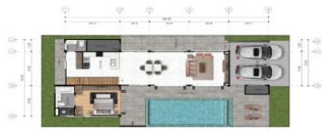
Second floor of villa type "A"