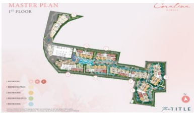
2 BEDROOM (64 - 68 sq.m.)