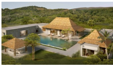
FLOOR PLAN 2-BEDROOM MODERN LUXURY VILLA