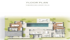
LAND PLOT FROM 800 - 1000 SQM COVERED AREA 2500 SQM EXTERNAL AREA 1000 SQM TOTAL BUILD UP AREA 2500 SQM