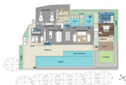
SAMSALA VILLA 7 - 2nd FLOOR PLAN