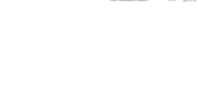
MASTER PLAN GROUND FLOOR