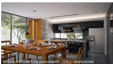
VILLA 4 BEDROOM THE HARMONY TYPE A - DINING ROOM