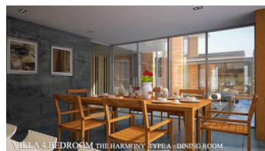
VILLA 4 BEDROOM THE HARMONY TYPE A - DINING ROOM