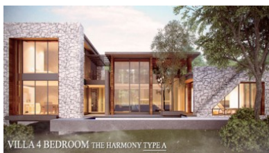
VILLA 4 BEDROOM THE HARMONY TYPE A