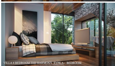
VILLA 4 BEDROOM THE HARMONY TYPE A - BEDROOM