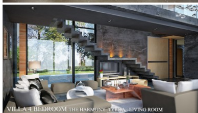
VILLA 4 BEDROOM THE HARMONY TYPE A - LIVING ROOM